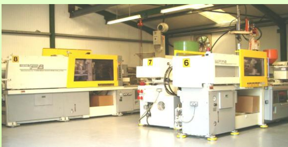
Plastic injection moulding facility.

The Premier Water Meter Boundary Box has two pipe fitting options depending on request. Premier Boundary Water Meter Box connections are available in Push-fit 25mm MDPE and also a compression connection suitable for ½” inch Irish Heavy Gauge pipe. The units suit 1½ inch concentric water meters and are robust in design. They are easy to install and operate. The units can be installed as retrofit or in new installations.