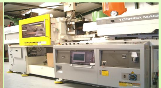
Established : 1986.