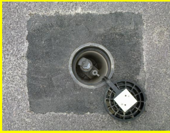
Premier Boundary Water Meter Box in service.